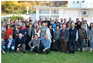
Balkan Prayer Conference