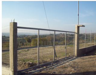
Training & Retreat Center Wall