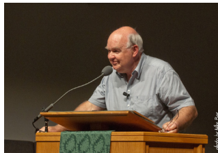
Dr. John Lennox