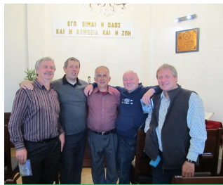
Team in Berea