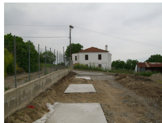
Plenty of Work for Labor Teams