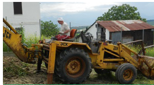
JCB Clearing Area