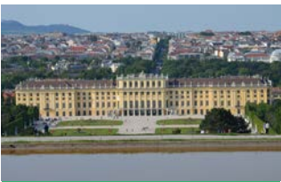
Schonbrunn Palace in Vienna, Austria