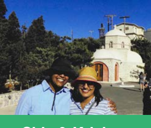
Shiv & Krishna