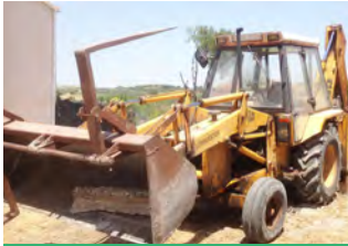
JCB, "Jessie B"