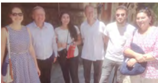
French visitors to Berea