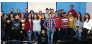
Youth with Gary