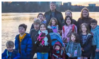
Washington D.C. with family