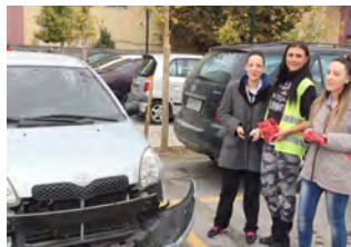
Scene of the car accident