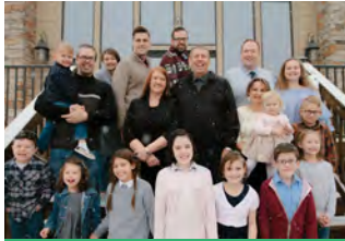
The Lyttle Family