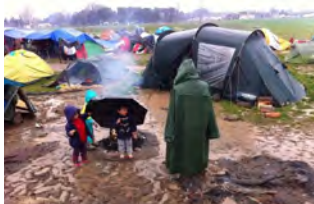
Refugees face ongoing hardship