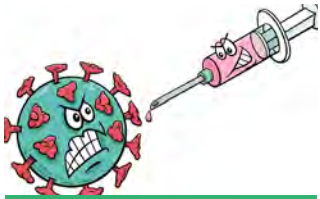
Both fully vaccinated

Dear Praying Partners, Friends and Family,