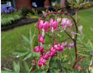
Bleeding Heart Flower