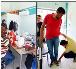
Refugees learning to make clothes