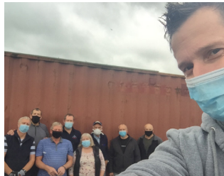
Helpers filling the containers

People have asked us how we can keep going without meetings or church offerings, but our answer is as always, 'God's Promise in Philipians 4:19 is as sure now, as it was the day it was written'. Many of you, wonderful friends, have gone above