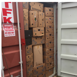
Full container or refugee relief